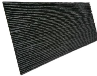
Photography - Piece