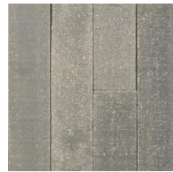
CS 29 GR