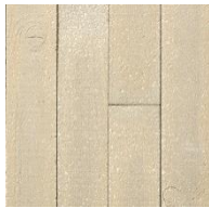
CS 28 GR