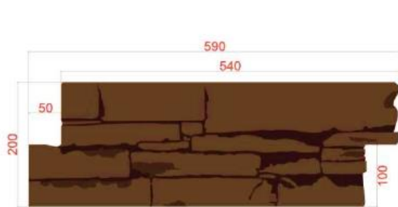
Thickness ≈ 30/50 mm Piece Dimensions - Flat Elements